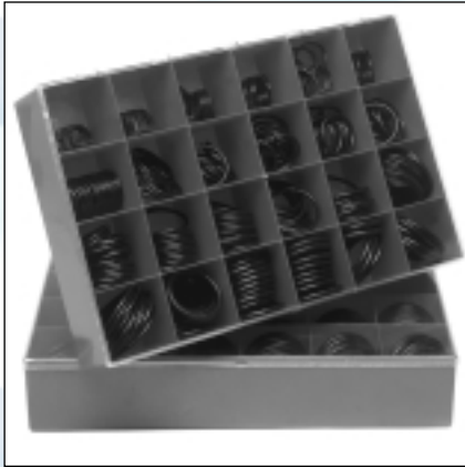
Type C - DIN Metric